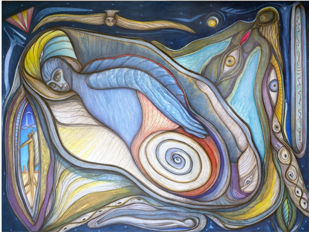
Interpreters of Truth