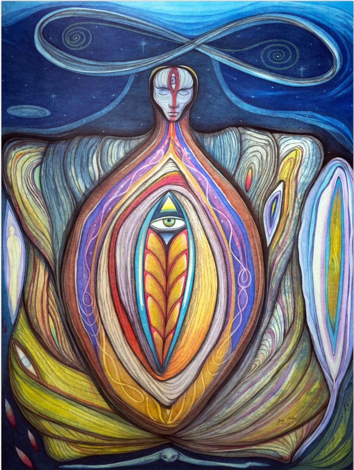
Intricacy of the Integral