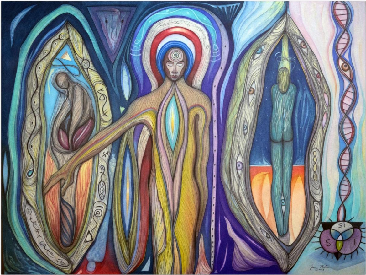
Theater of Life