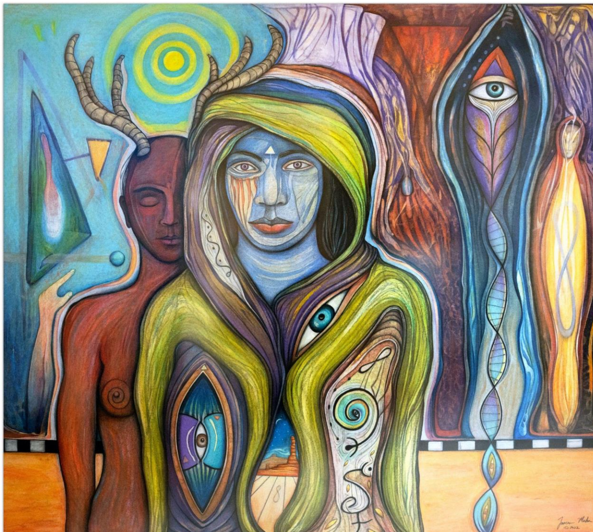
That Which Awakes Us