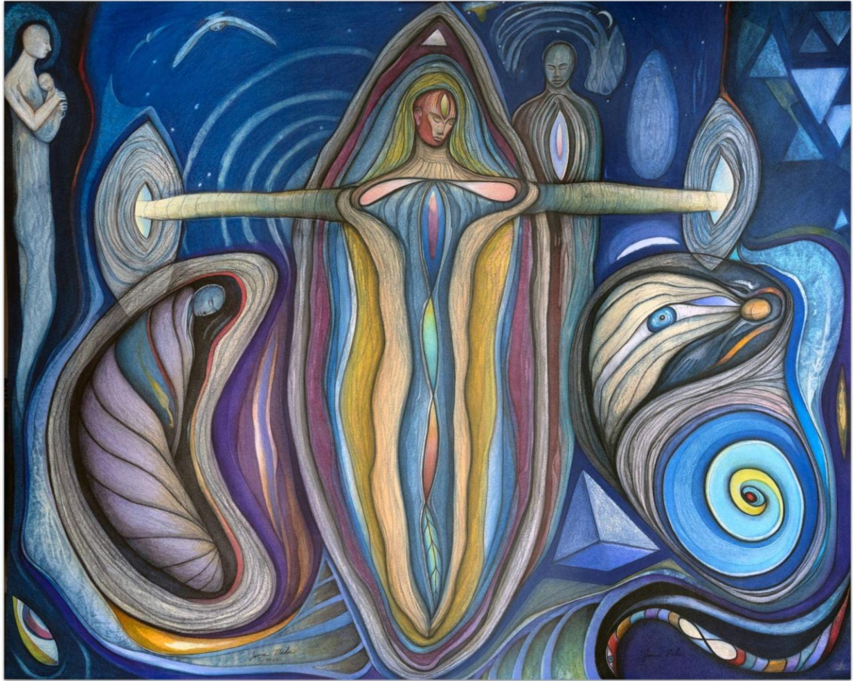
Evolution of Consciousness