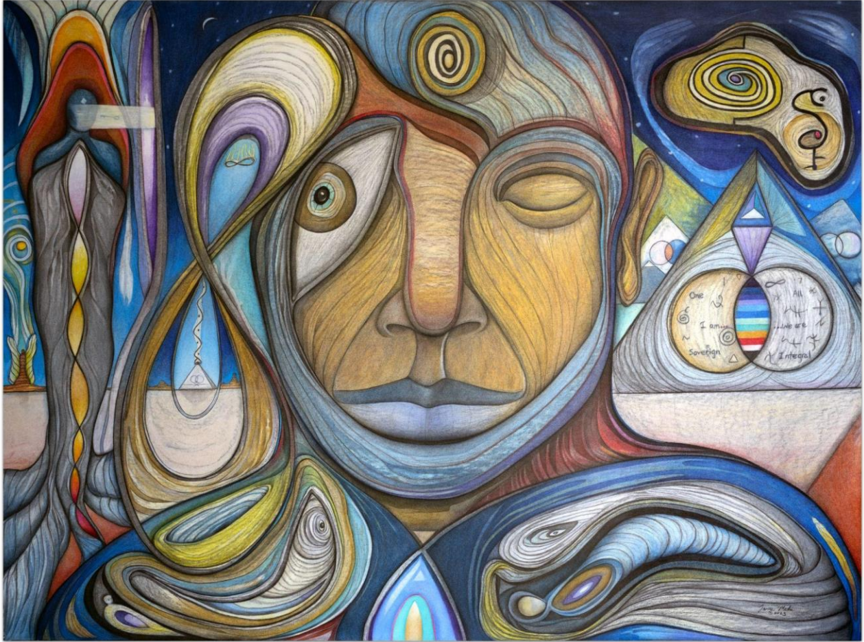
Evolution of Consciousness